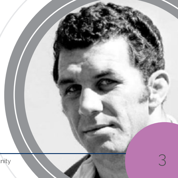
The Late John Sattler Rugby League player